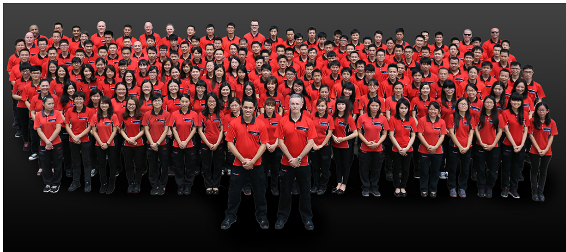
(Star Prototype in 2015)

Without any investment whatsoever STAR has now grown to be more than 200 people with sales of approximately EUR 13m. We have cash in the bank and are completely self-financing.